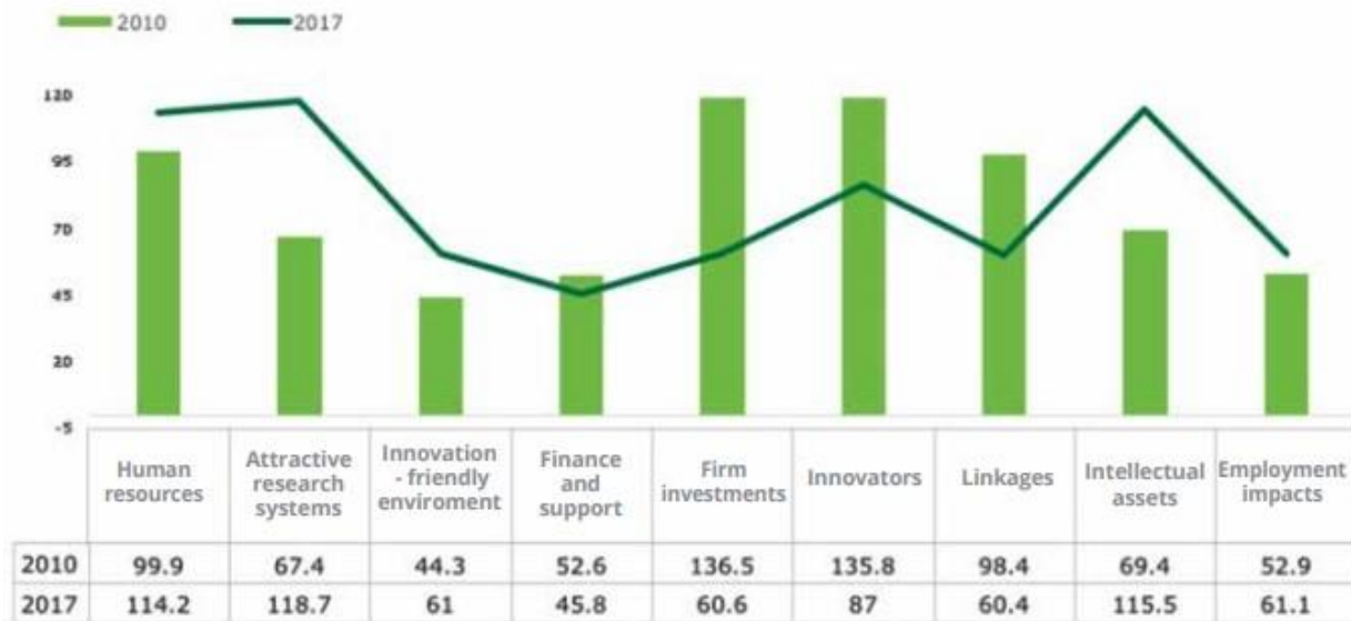
Figure 2: Cyprus European Innovation Scoreboard 2018

On the other hand, Cyprus' research systems and human resources, with the number of new PhD graduates showing a huge increase (Statistical Service of Cyprus), as seen in the graph below.